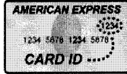
AMEX: 4 digits

INSTRUCTIONS: Check the box next to the card you will be using. If you are using a MasterCard or Visa , you will need to give the 3 digit numbers you will find on the reverse side of your card located on the signature panel. It will be the last three numbers. When using an American Express card you will need to give the additional four (4) numbers from the front of the card. Your information cannot be processed without these numbers.