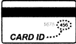
VISA or MC: 3 digits